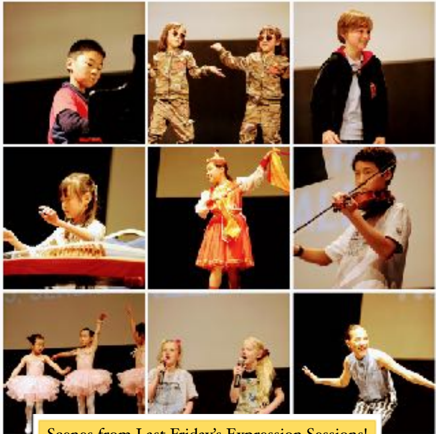
Scenes from Last Friday's Expression Sessions!

Cafeteria: https://hq.scis-his.net/content/lunch-menu