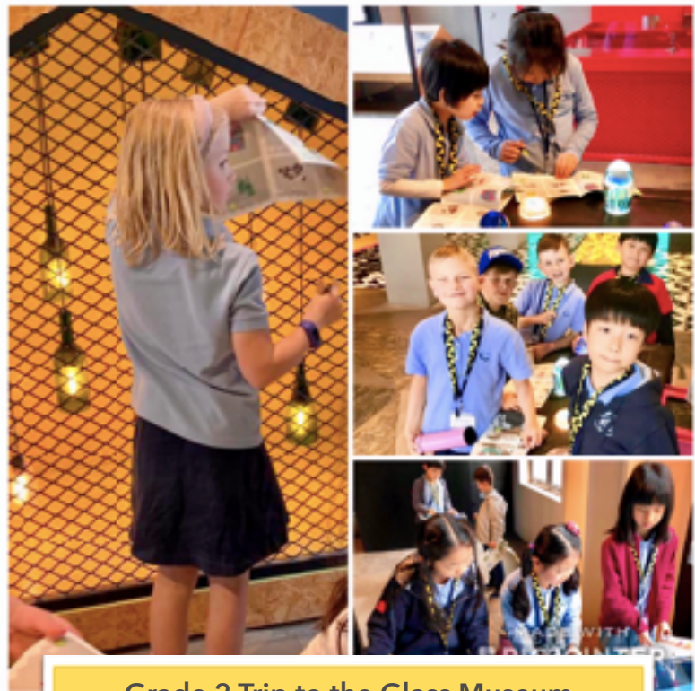
Grade 2 Trip to the Glass Museum

We are entering a very busy time of the school year with many events and opportunities for children and parents. Please follow the dates listed here and through your classroom teacher so nothing important is missed. Enquire for more details when needed.